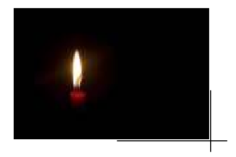
Forgive the past is similar to planting the seed of healing